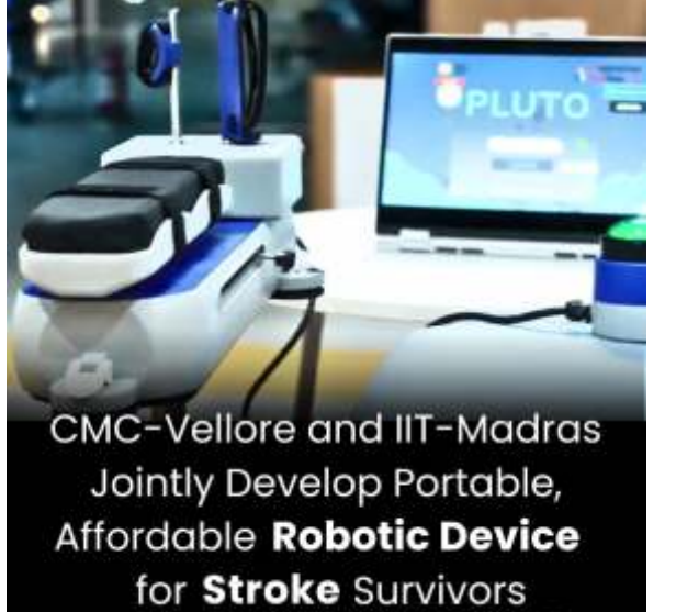
CMC-Vellore and IIT-Madras Jointly Develop Portable, Affordable Robotic Device for Stroke Survivors