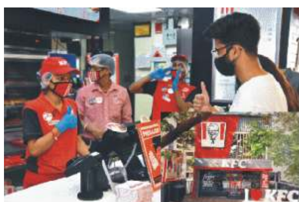
Indian Spicy Veg.

KFC has been delighting chicken lovers in India for over two decades with its crave-worthy food. KFC India's menu is a strong mix of universally loved products like the iconic Hot & Crispy Bucket, Zinger Burger, Popcorn Chicken as well as innovative limited time offerings that are rooted in local flavours such as the KFC Chizza, Rice Bowlz, Veg and Tandoori Zinger amongst others. KFC India's newest launch includes a range of Rolls such as Thai Spicy, Korean Tangy, American Nashville, Indian Tandoori and