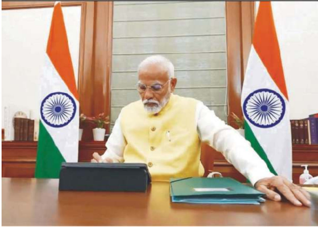
leaders from India's neighbourhood and the Indian Ocean region. President Droupadi

Chennai, June 10 2024: After being sworn in as Prime Minister for the 3rd time, PM Modi Narendra Modi's signed his first file authorising the release of 17th installment of PM Kisan Nidhi. The scheme will benefits 9.3 crore farmers and distribute around Rs 20,000 crores. After signing the file, PM Modi said "Ours is a Government fully committed to Kisan Kalyan. It is therefore fitting that the first file signed on taking charge is related to farmer welfare. We want to keep working even more for the farmers and the agriculture sector in the times to come." The first meeting of the new cabinet is expected to be held this evening at the Prime Minister's residence at Lok Kalyan Marg. The allocation of ministerial portfolios is anticipated shortly thereafter. Narendra Modi was sworn in as the Prime Minister of India for his third consecutive term on Sunday at the Rashtrapati Bhavan in an impressive ceremony attended by