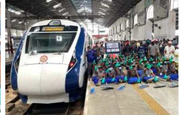
Vande Bharat train at Chennai Egmore station during the cleaning campaign.

of Vande Bharat. The 14 Minute Miracle Cleaning Scheme will save time for the passengers at the destination station for the return journey of the Vande Bharat train and it will ensure that the passengers are able to board a cleaner train in a shorter time.