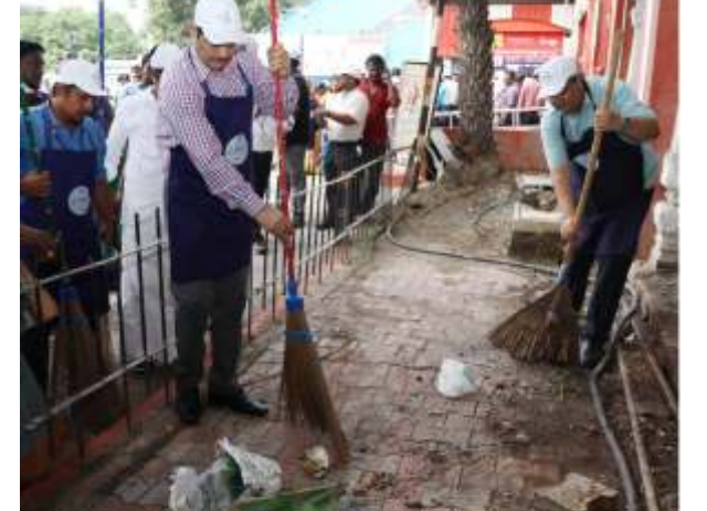
Additional General Manager participating in the Swachhata Hi Seva event at Dr MGR Chennai Central.