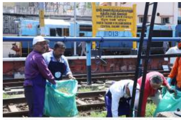
Cleanliness workers participating in the Swachhata Hi Seva event.