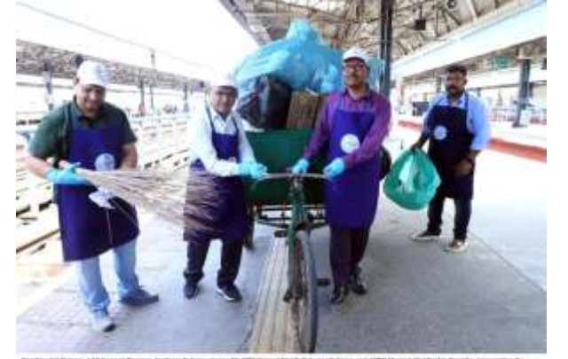
General Manager participating in the Swachhata Hi Seva event at Chennai Egmore.

As part of the Swachhata Hi Seva Cleaning Program on 1st October 2023, a novel scheme named '14-minute miracle' has been launched on pilot basis for three incoming rakes