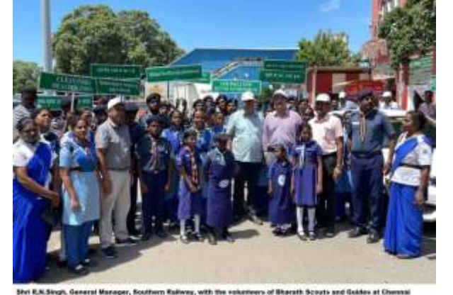
Group photo of participants at Chennai Egmore Railway Station.

Train No 20644 Coimbatore - Chennai Vande Bharat which arrived at Dr MGR Chennai Central at 11.50 hrs was cleaned at a record 14 minutes at Dr