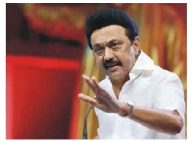
Karnataka has changed emphatically put forth Regulatory Committee meeting it was unanimously decided

The Minister water, the state Minister Duraimurugan underlined that on government asserted on said the requirement for August 10, in the Friday and said Cauvery water was Cauvery Water