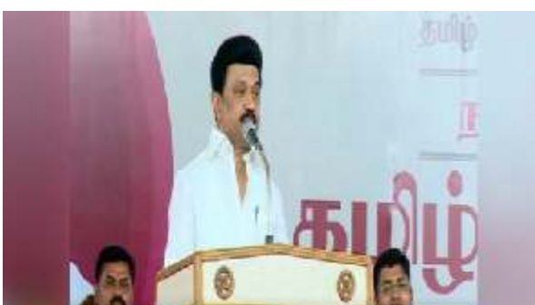
Day and highlighted the one's life.

Tamil Nadu Chief Minister MK Stalin on Sunday extended greetings on the importance of books in he highlighted "Good occasion of World Book