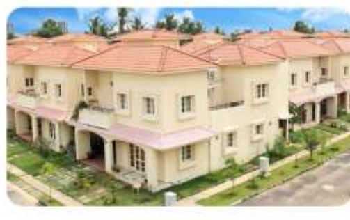
Bougan Villa - lyyapanthangal