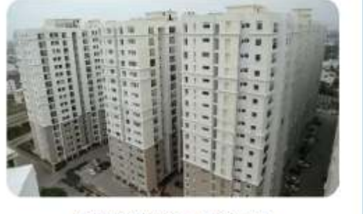
Orchid Spring - Alliance