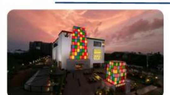
VR Mall - Anna Nagar