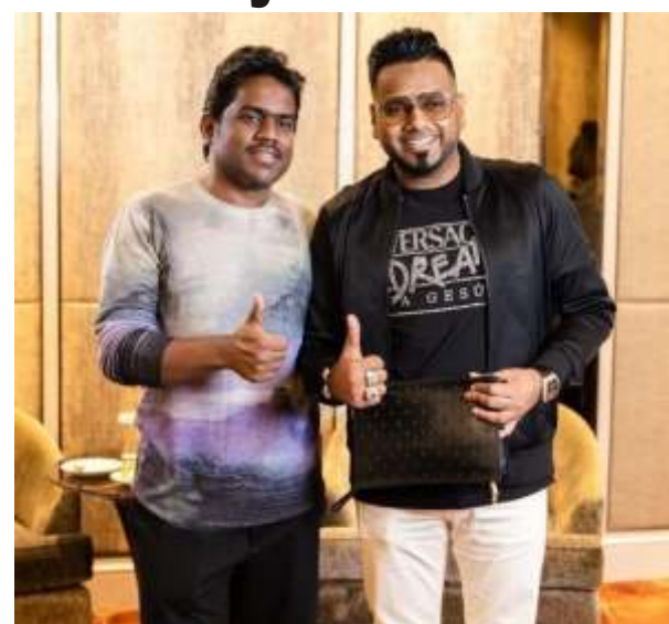
along with Yuvan; Andrea, Neha Bhasin,