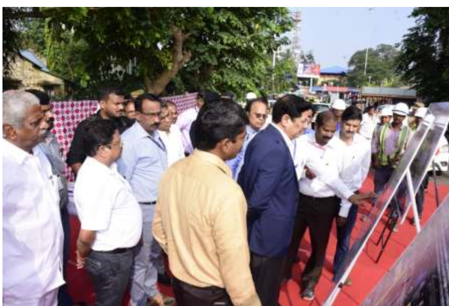
Railway Stations in Kerala

Station Redevelopment is an ambitious initiative taken up by the Ministry of Railways under the aegis of Shri Narendra Modi, Hon'ble Prime