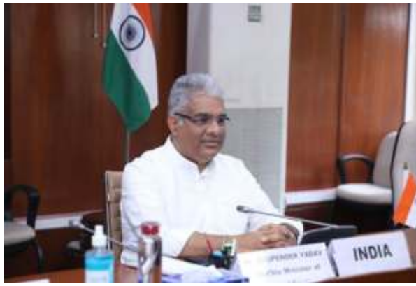
for Skill development in green sector. The variety of Decentralized Renewable Energy livelihood opportunities which are being developed in India, including myriad solutions like solar dryer,

As regards the priority issues discussed in the meeting, the Minister said that Climate change is necessitating a shift towards more sustainable development and green jobs. He further informed that a Sector Council for Green Jobs has been set up in India to develop strategy and implement programs