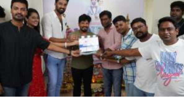
முன்னணி நடிகர்கள் இடம் பெறுகிறார்கள்.