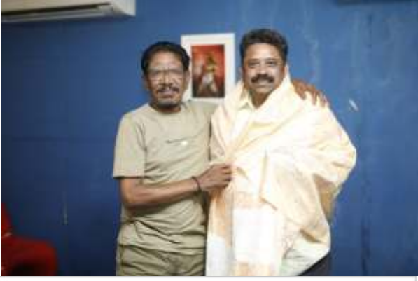
விமர்சன ரீதியாக அனைவரது பாராட்டுகளையும் பெற்று வரும் மாமனிதன் திரைப்படத்தை கண்டு ரசித்த இயக்குனர் பாரதிராஜா இயக்குனர் சீனுராமசாமி தேரில் அழைத்து பாராட்டியுள்ளார். சிறந்த படத்தை இயக்கியுள்ள சீனு ராமசாமி அவர்களை தேரில் அழைத்து பாராட்டிய இயக்குனர் பாரதிராஜா, இயக்குனர் சீனுராமசாமி “என் மகன்” என புகழாரம் சூட்டியுள்ளார் என்பது குறிப்பிடத்தக்கது.

காயத்திரிக்கு அவங்க அப்பா மாப்பிள்ளை பார்ப்பதை அறிந்து கொள்ளும் விஜய்சேதுபதி காத்துவாக்குவ ரெண்டு காதல் படத்தில் வருவது