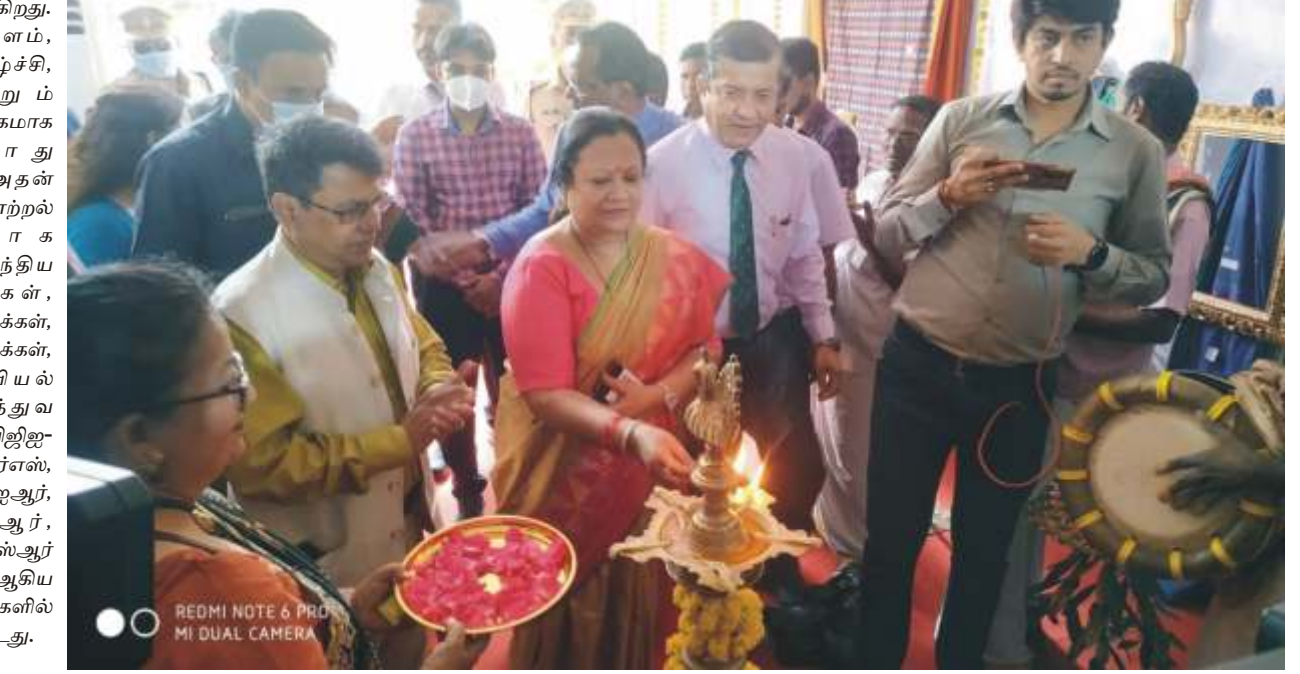
நெசவு 2022 - கைத்தறி கண்காட்சியை மத்திய ஜவுளி மற்றும் ரயில்வே துறை இணை அமைச்சர் தர்ஷனா விக்ரம் ஜர்தோஷ் சென்னையில் தொடங்கி வைத்தார்.