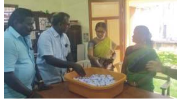
அலுவலகத்தில் பரிசு குலுக்கல் முடுவார்பட்டி. கிராமத்தை வட்டார வளர்ச்சி அலுவலர் முன் நிறுவனம் ஊராட்சி தலைவர் நடைபெற்றது. குலுக்கல் முடிவில்

மதுரை அக்டோ 20, 2021: கடந்த 10 ந்தேதி தமிழகம் முழுவதும் மெகா கொரானா தடுப்பூசி முகாம் நடைபெற்று மேலும் பொதுமக்களிடையே விழிப்புணர்வு ஏற்படுத்தும் வகையில் கொரானா தடுப்பூசி போடுபவர்களுக்கு குலுக்கல் முறையில் சைக்கிள், மிக்லி, குக்கர் உள்ளிட்ட பல பரிசுகள் வழங்கப்படும் என்று தமிழக அரசு அறிவித்திருந்தது, அந்த வகையில் பொதுமக்கள் ஆர்வமுடன் தடுப்பூசி செலுத்திக்கொண்டனர். அந்தவகையில் மதுரை மாவட்டம் அலங்காநல்லூர் ஊராட்சி ஒன்றிய